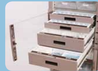
Available in full or half-height sizes