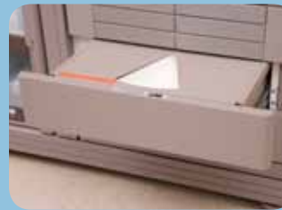
Carousel pocket: Available in 2, 4, 6, 8 & 12 bin sizes