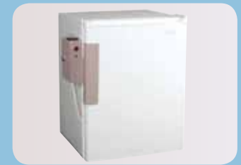
Secure, automated management of refrigerated items

Maximize efficiency: www.cubexsystem.com